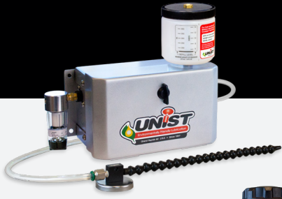
Coolubricator™ and Serv-O-Spray™ systems available with multiple outputs